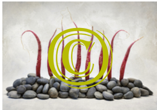
Title: Radish Sentries Dimensions: Image: 14 x 20 Mat: 22 x 28 Price: $450 File: Radish Sentries _JYemma.jpg