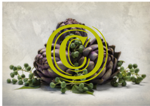
Title: Purple Artichokes Dimensions: Image: 14 x 20 Mat: 22 x 28 Price: $450 File: Purple Artichokes _JYemma.jpg