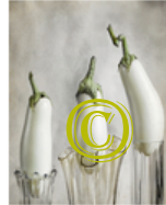
Did You Hear? Price: $450